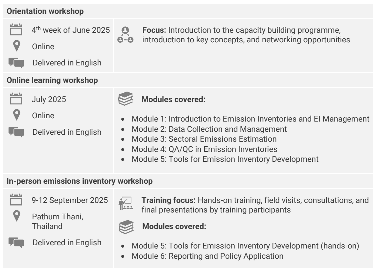
Figure 2. Capacity Building Programme Modules and Contents